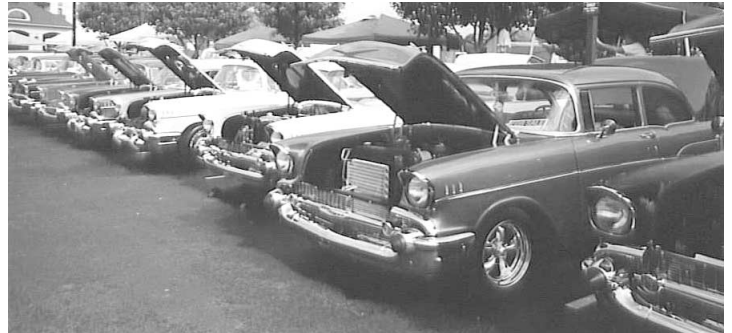
Oldies... but goodies.

It's been said that the classics never die...and that was certainly evident by the throngs of vintage car admirers that turned out on May 20 for the annual Smoky Mountain Classic Chevy Club's spring show in Pigeon Forge. Nearly 200 cars made their way to the Music Road Hotel to register for what continues to be a first-rate event. Scores of vendors were selling everything from mufflers to car-themed tee shirts and sunglasses.