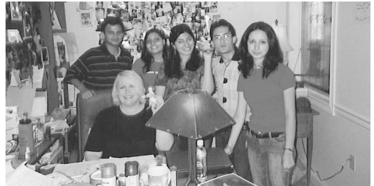
Our new McFriends

Here's an answer for all you fans of the game show Jeopardy... "A primarily Muslim Nation located just west of India". If you said, "What is Pakistan?"...you win!