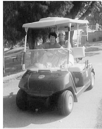
The hospitality cart makes the rounds.

These incredible supporters took an entire week off before beginning to make plans for the 2007 event that has already been set for August 4th. It's never