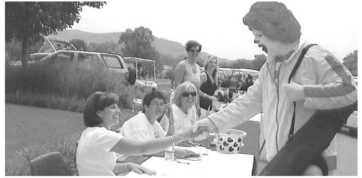
Wonderful volunteers at check-in

A short-lived thunderstorm did little to dampen the enthusiasm for dinner as golfers scampered off the