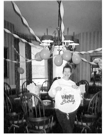
Celebrating a 6-month birthday

Amid the birthday festivities more than a few tears were shed in grateful appreciation for the daunting medical challenges the little princess has faced...and conquered. (Anyone wishing to read more about