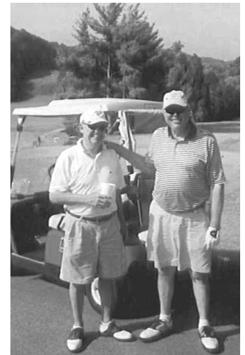
Duffers enjoying the perfect summer's day.

too early to mark those calendars as this stellar event is always a sell-out! ♥