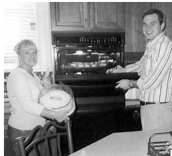
Chefs at work

School, Oriental Masonic Lodge, Fellowship Church, NOVA Information Systems, The Stokes family, Laurel Church of Christ, the Mom's Club of Maryville, and Gamma Sigma Sigma from U.T. Families truly appreciate this touch of home dur-