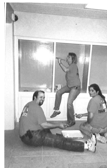
Our home improvement experts...