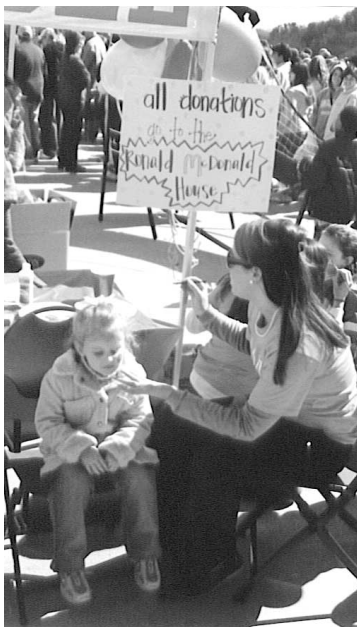
A young fan supporting her team.