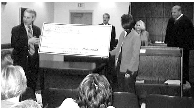
Knox County Mayor Mike Ragsdale makes the presentation.

Typically our legal system brings to mind lawyers, judges, and justice.