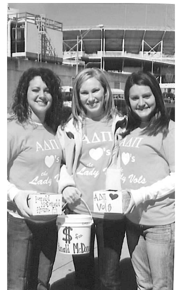
Who could resist making a gift?...