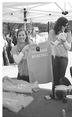
A cool day for a hot deal on UT wear!

ramps leading up to the stadium 2 large tents were erected where the ladies were selling "Big Orange" tee shirts, giving away candy, and taking donations to paint the faces of zealous fans.