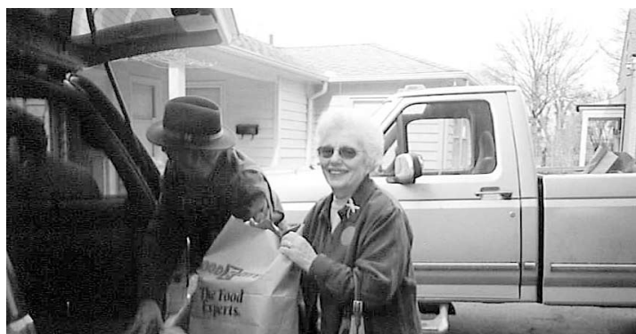
The bounty arrives...

many of their clients help produce the meats, vegetables, and