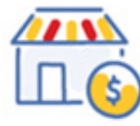
Round Up At McDonald's