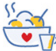
Provide Meals That Heal