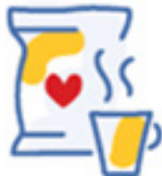
Send Wishlist Supplies